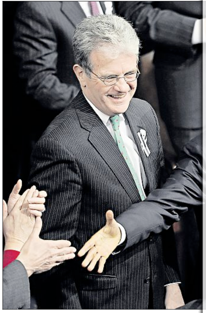
Grand entrance: President Obama, flanked by Sen. Tom Coburn, R-Okla., greets members of Congress on Tuesday night.

Obama urges bipartisanship to 'win the future' in global fight for jobs